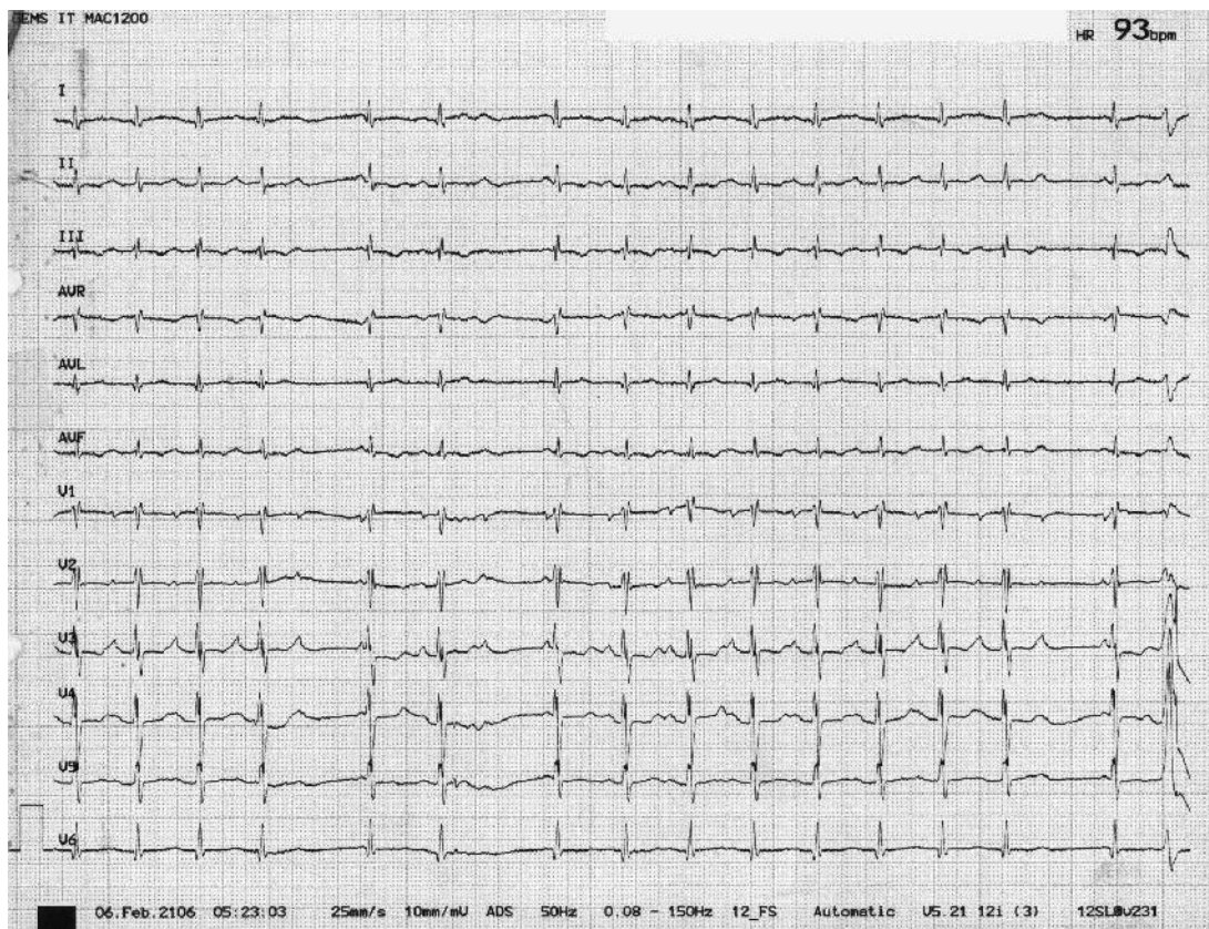
Fig 3: The 12 leads electrocardiogram from the previous admission of the patient revealed second degree Mobitz type 1 (Wenckebach) heart block.

calcium channel blockers have shown to be useful in preventing NTBI from entering cardiomyocytes via these channels [8].