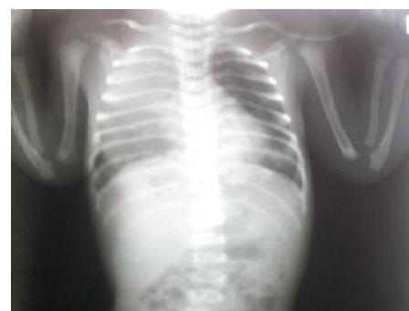
Fig. 2: Chest X-ray after treatment for 1 week