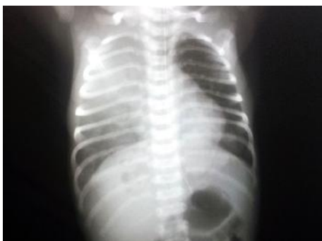
Fig. 1: Chest X-ray at admission

Neuroblastoma is characterized with densely cellular, primitive, "small blue-cell tumor" appearance. Undifferentiated neuroblastoma may