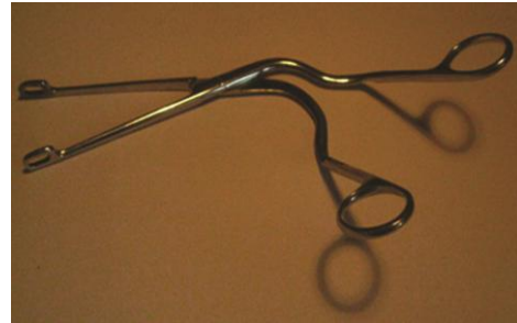
Fig. 2: Throat operating forceps

anesthesia is suitable for relatively old and cooperative pediatric patients. Moreover, the foreign body should be located at the upper part of the narrow site of the esophagus and could be partially seen using laryngoscopy. For anxious patients, an appropriate volume of a sedative could be given.