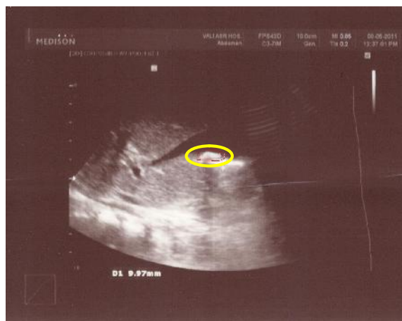
Fig. 2: Circle shows stone in the gallbladder

Comparison of the groups with and without nephrolithiasis demonstrated no significant differences with respect to age, body weight, dosage of drug and the duration of treatment. Nephrolithiasis showed a significant relation with male gender ( P=0.02 ) (Table 1).