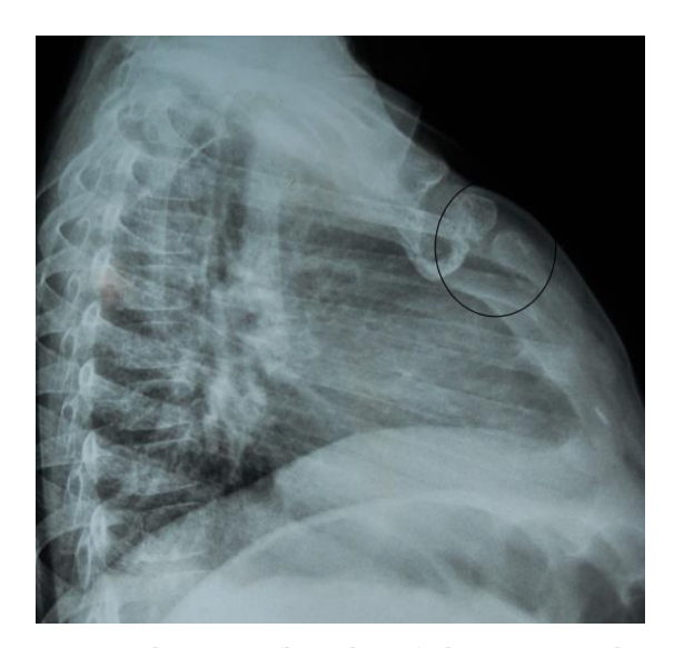
Fig. 2: Chest X-ray (lateral view) showing cortical breach and erosion of upper third of sternal body

ELISA test for HIV I and HIV II antibody was negative. Serum IgA level was within normal limit – 120 mg/dl (reference: 80-170mg/dl). Chest X-ray (lateral view) showed cortical breach, erosion of upper third of sternal body with retrosternal soft tissue calcification (Fig. 2). Chest X Ray (PA view) did not show any evidence of pulmonary tuberculosis. Tuberculin test with 5 TU was positive with an induration of 15 mm × 17